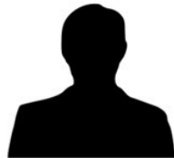
A N Other Newsletter & Website Administrator