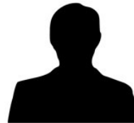
A N Other Website Support